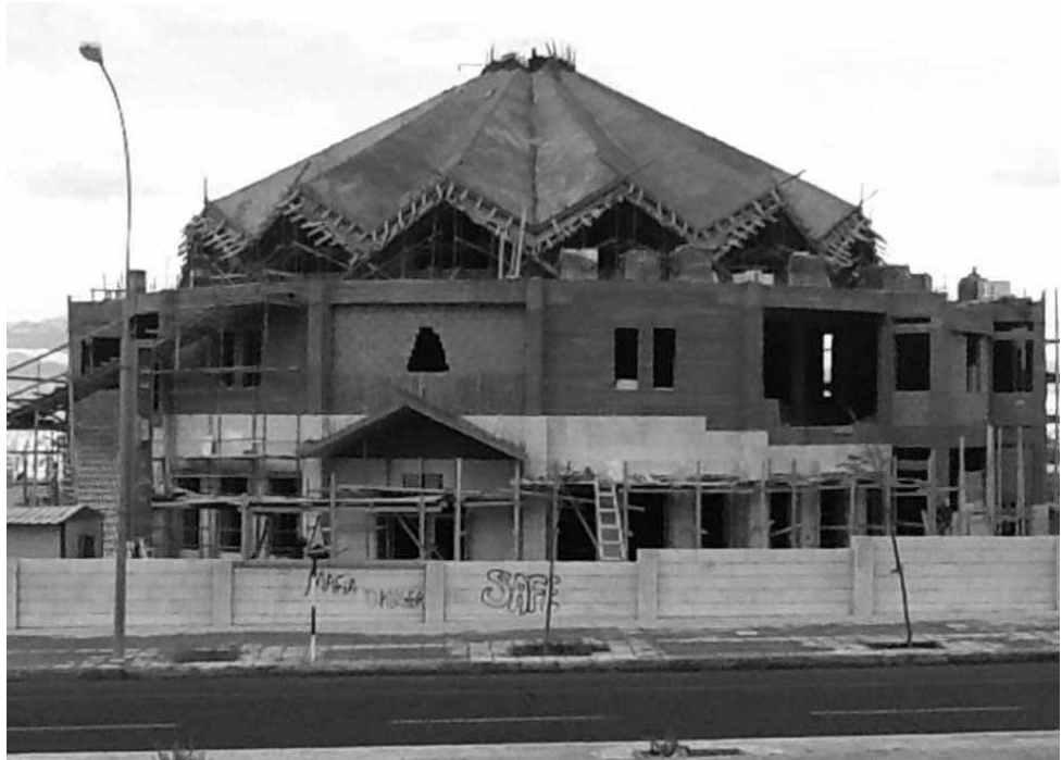
The construction work for the Church of Stella Maris in Aqaba as it was at the end of March.

The Equestrian Order of the Holy Sepulchre of Jerusalem is involved once again in 2012 in the realization of two of the more demanding projects of the Latin Patriarchate, projects whose work was suspended last year: these are the construction of Stella Maris parish Church and multi-purpose room annex and a secondary school in Rameh, in Galilee.