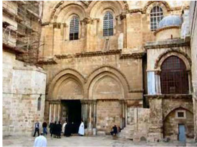
Church of the Holy Sepulchre of Jerusalem