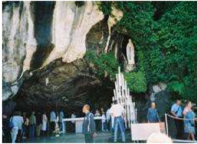
The Grotto of Our Lady of Lourdes

Church in the Land of Jesus. It began to accept new challenges emphasizing the strengths that set the Order apart from the other Catholic organizations.