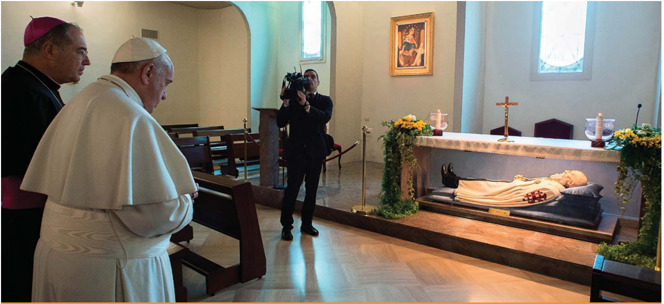
Pope Francis in Pompeii, in silent prayer before the body of Blessed Bartolo Longo, Knight of the Holy Sepulchre, servant of the poor, and Apostle of the Rosary.

ered to the poorest inhabitants of this Italian city stricken by unemployment and endemic corruption.