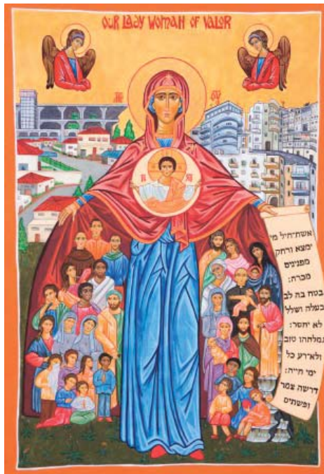
Icon of Our Lady Woman of Valour, protector of the migrants in Israel.