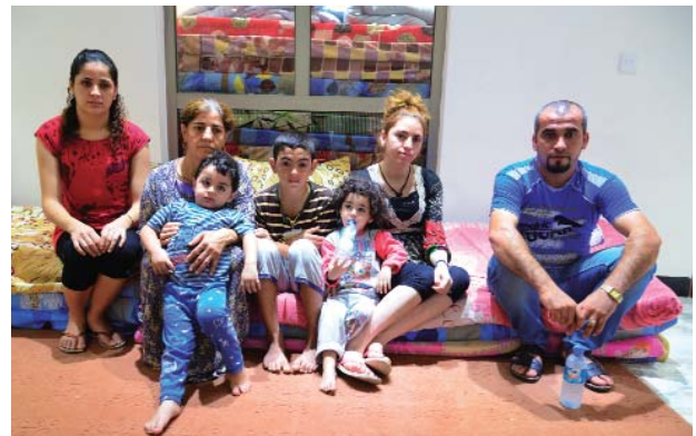
A family of refugees from the Middle-East which hopes, one day, to return to the land of their ancestors.

"We can pray in communion with the Church on earth and in heaven. Let us not underestimate the power of so many voices united in prayer!", he insisted, in speaking of this initiative which was largely observed by the dioceses, in particular with the assistance of members of the Order of the Holy Sepulchre who also help by acts of charity. Thanks no doubt to the permanent attention the Holy Father pays to our persecuted brethren living